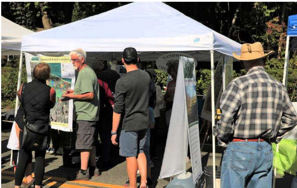
The SCT booth had lots of visitors at SandwichFest.

A WORK SOCIAL The nor'easter of October 27th took down trees and branches in our Elinor's Woods Preserve off of Ploughed Neck Road, so SCT trustees planned a work day for December 4th, which we later agreed was more of a "work social", to coin a term. We sent out an invitation to all those who had indicated interest in volunteering, and we had a great turnout, 21 of us in all. Again, after such a long time of Covid caution, this outdoor event felt like a celebration, only a lot of useful work was accomplished as well. We all agreed we would like to have more "work socials", but without the nor'easter! If you wish to help the SCT as a volunteer, there is a space on the SCT dues envelope where you can indicate your interest.