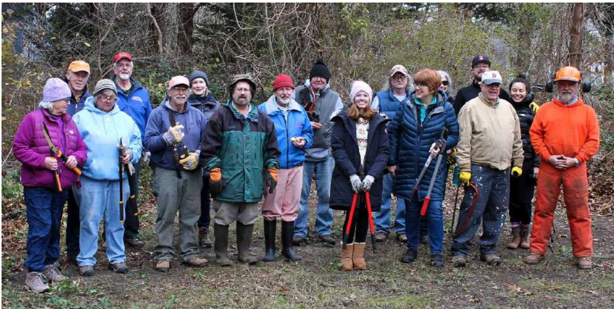
The group poses after work is completed.