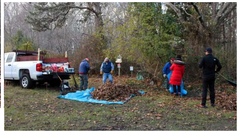
Making the entrance presentable