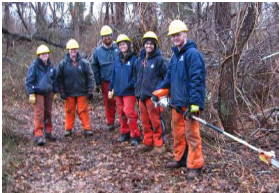
On Great Island We can't say enough about the helpfulness of AmeriCorps Cape Cod. The group shown here came back to Great Island in January to re-clear the storm-damaged trails.